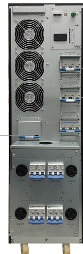
E91-15/20kVA rear view